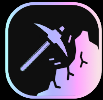
Navigator 50 Volts