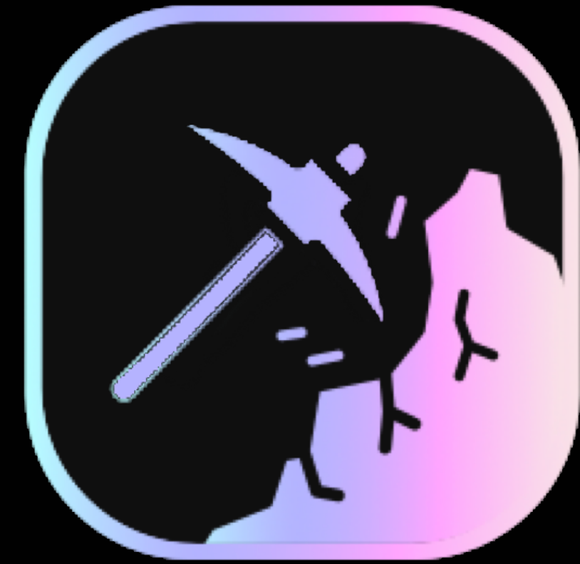
Titan 400 Volts