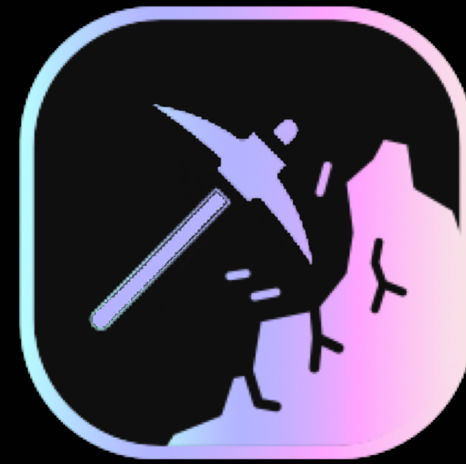
Vanguard 200 Volts