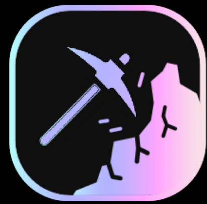
Trailblazer 100 Volts